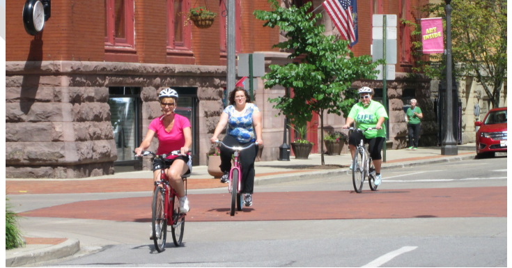
Cyclists in downtown Erie.

Through many discussions, we learned how important multimodal amenities are to everyday activities, such as getting to work, walking children to school, or getting to a hospital or a park. Discussing these kinds of projects even in smaller communities helps to identify multimodal wants and needs and allows PennDOT to provide direction on how to begin to turn them into realities.