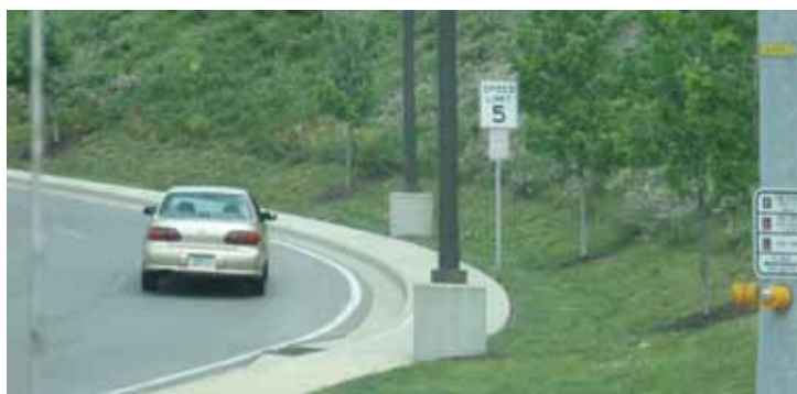
Unreasonable speed limits can compromise safety and complicate enforcement.

On the other hand, here is what we know to be true about speed: