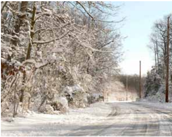
Consider using salt brine this winter before your roads look like this. With salt brine, municipalities can decrease their use of salt and enhance both the environment and their budgets.

For additional information, contact your PennDOT district municipal services office or Tom Welker in PennDOT’s Central office at twelker@pa.gov or (717) 783-3721. 📞