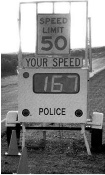
So how bad is your speeding problem?!