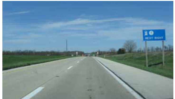
Sure, you can go fast here where the roadway design encourages higher speeds.

As the caretakers of local roads, municipalities can reinforce these expectations through proper road design and applying speed management principles.