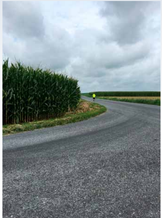
The Upper Leacock Township road crew measures the sight distance at an intersection by a cornfield to determine how much corn to remove to improve visibility for motorists.

LTAP assisted the township by conducting intersection corner sight distance studies at two locations. The township road crew was taught the process for determining minimum sight distances and how much corn should be removed.