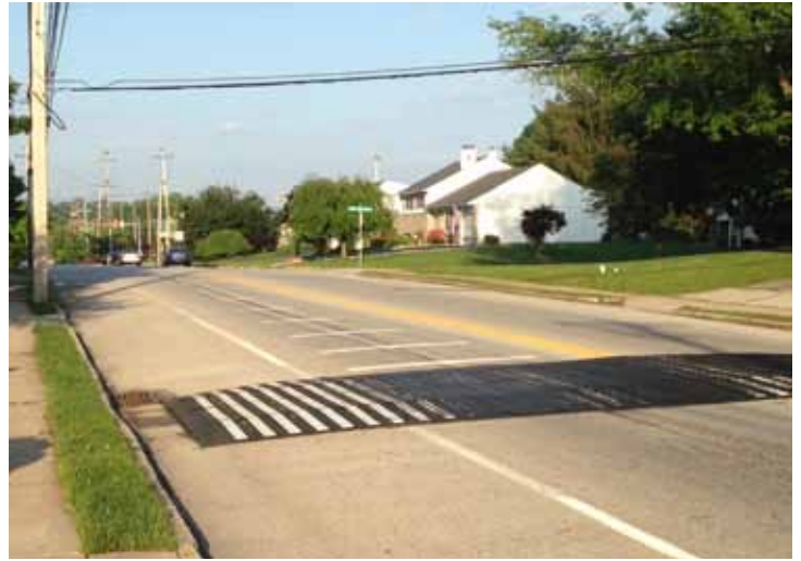
Upper Merion Township installed a temporary speed hump to test the benefits and impacts of speed management on this roadway.

Municipalities should also have a process in place to prioritize projects, based on safety benefits, funding resources, synergy with other projects, and speed reduction.