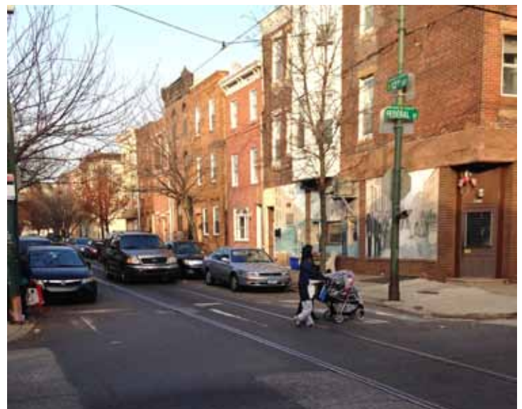
But, please drive slowly here where you can expect pedestrians and traffic congestion.