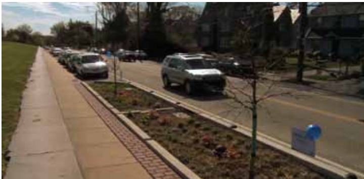
This curb extension along Queen Street in Philadelphia narrows the street and helps to manage traffic speeds.

The countermeasures appropriate for your roads will depend on the nature of the issues identified in Step 1. Remember that any countermeasure you employ must follow federal and state guidelines for design and construction.