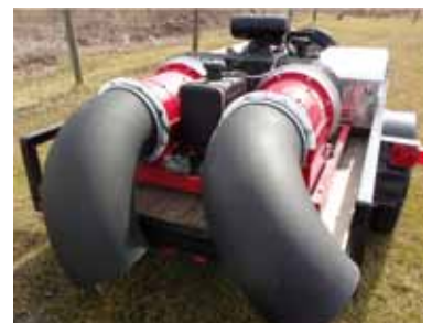
Runner-up: Road ditch cleaner designed by Armstrong Conservation District