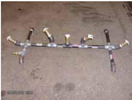
Swatara Township's winning invention: a high-pressure undercarriage sprayer

Swatara Township in Dauphin County received first-place honors in PennDOT LTAP's 2016 Build a Better Mousetrap Contest, and Armstrong Conservation District placed as runner-up.