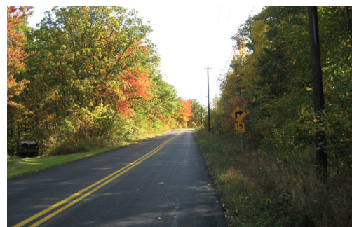
A typical center line pavement marking application.

Center line markings have an important function — to provide information to road users. Center line pavement markings delineate the separation of traffic lanes that have opposite directions of travel. They can also be used as a safety feature to provide drivers with additional guidance around curves or over hills. Further, center lines can be used to indicate areas where passing is permitted and/or restricted.