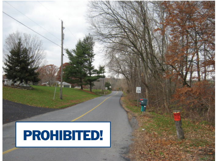
The MUTCD prohibits the use of solid single line center lines.

Municipalities can use a variety of materials for center line markings. The most commonly used material on paved roadways is waterborne paint, which is typically the most cost-effective