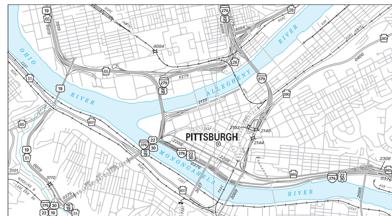
DOWNTOWN PITTSBURGH 4:1

COPIES OF THIS MAP ARE AVAILABLE AT NOMINAL COST CONTACT: PENNSYLVANIA DEPARTMENT OF TRANSPORTATION SALES STORE P.O. BOX 3451 HARRISBURG, PENNSYLVANIA 17105 - 3451 TELEPHONE: (717) 787-6746