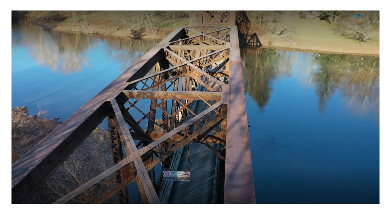
A drone image from above a truss bridge.