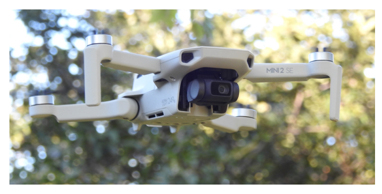
A DJI Mini 2 Drone being deployed.

Drones, also known as unmanned aerial vehicles (UAVs), are multi-rotor, remote-controlled flying devices that offer live first-person viewing and can capture high-resolution images and videos from the air. Over the past decade, state departments of transportation (DOTs) have increasingly employed the utility of drone technology in all phases of project development, including planning, design, construction, and maintenance. Drones enable access to areas that would be difficult or impossible to reach on foot, such as steep and rugged terrain, densely forested areas, and bodies of water. The ability to access hard-to-reach locations, cover large areas quickly, collect data efficiently and accurately, and keep people away from dangerous locations has made drones an attractive tool for DOTs. In addition, drones can be used to conduct structural inspections on critical infrastructure (e.g., bridges, dams, and buildings) as well as monitor dangerous environmental conditions such as erosion and flooding.