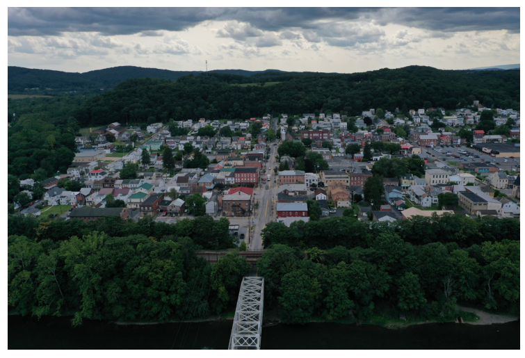
A drone photograph of Newport Borough in Perry County.

In early 2023, PennDOT conducted a survey of local government agencies to identify if and how they are currently using drones and whether they would like to use drones for maintenance, operation, and safety of local transportation infrastructure. Of the 162 survey respondents, 92 of them (57%) indicated that they are using drones. The most cited applications (selected from a list) among those using drones were general mapping/photogrammetry/aerial photography (71%), and emergency response/incident management (67%).