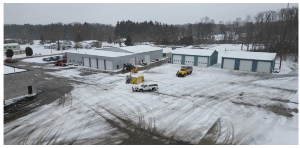
A drone photo of Summit Township's public works buildings in Crawford County. Photo: PennDOT LTAP

A drone photo of a Summitt Township truck and plow in Crawford County. Photo: PennDOT LTAP