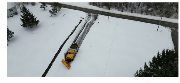
Continued on page 5

A drone photo of a Summitt Township truck and plow in Crawford County.