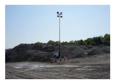
A RAP stockpile in Eastern Pennsylvania.

To RAP or not to RAP, that is the question. Yes, this is a good question for municipalities to ask. Should you allow Reclaimed Asphalt Pavement (RAP) in your asphalt mixes? Many local agencies across the state require PennDOT-approved mixes, and if Liquid Fuels funds are utilized for a construction or maintenance project, municipalities are required to utilize PennDOT Approved Materials (contact your PennDOT Municipal Services Representative https://www.penndot.pa.gov/Doing-Business/ LocalGovernment/MunicipalServicesRepresentatives/Pages/ default.aspx for more information). Approximately 90% of PennDOT approved asphalt mixtures include RAP, yet, we