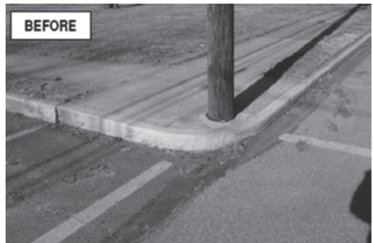
Possible Solution - Install Type 6 with intermediate landing.

Without the required curb ramps, sidewalk travel in urban areas is dangerous, difficult, and in some cases impossible for people who use wheelchairs, scooters, and other mobility aids. Curb ramps allow people with mobility impairments to gain access to the sidewalks and to pass through center islands in streets. Without curb ramps, these individuals are forced to travel in streets and roadways where they are put in danger or are prevented from reaching their destination. ♦