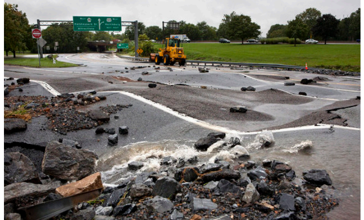
Know what to do when disaster strikes your roads.

Municipalities may have roadways that are designated as "federal