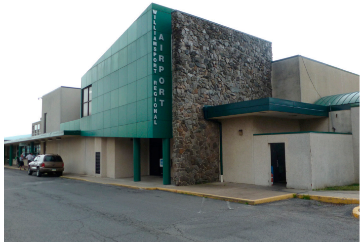
Current view of Williamsport Regional Airport Terminal. The existing terminal building at the Williamsport Municipal Airport will soon be replaced with a modern $13 million facility.