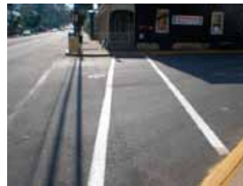
Type A crosswalk.

The parallel lines are optional in a Type C crosswalk, so the pattern may be just the perpendicular blocks. Consider using or upgrading to Type C, with perpendicular crossbars, particularly at locations that are midblock and/or at uncontrolled approaches. A midblock crossing is a nonintersection crossing where pedestrians need only negotiate traffic movement in two directions. An uncontrolled approach is a crossing in which there are no signs or signals to control traffic. Because this marking style has more painted surface area, it is the most visible to approaching traffic.