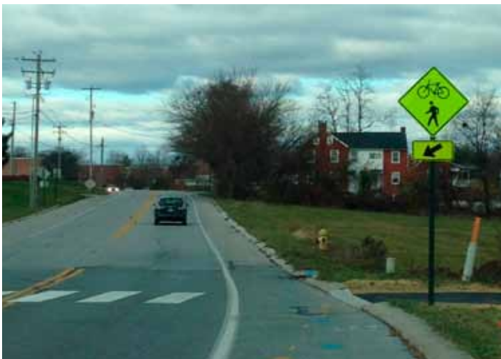
This fluorescent yellow/green combined bicycle/pedestrian warning sign alerts motorists of a trail crossing Wilson Avenue in Penn Township, York County.