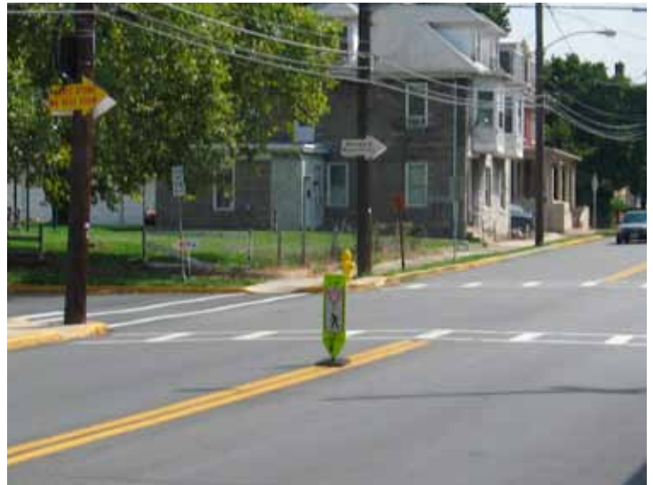
Motorists are more likely to yield to pedestrians in the crosswalk when an in-street pedestrian sign is used, such as this one at Third Street in the borough of Lemoyne, Cumberland County.