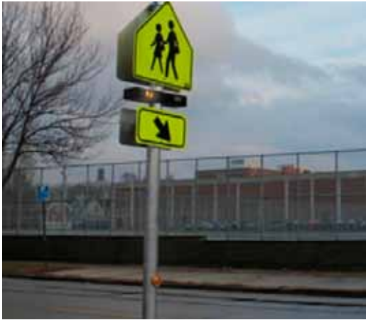
Adding rectangular rapid flashing beacons to signs can help to increase motorists' awareness.

Remember that signs placed on state routes will require PennDOT approval, and flasher units also require department approval before use.