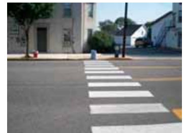
Type C crosswalk.