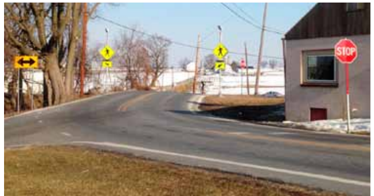
Additional signage was added at the street crossing of the Lancaster Junction Rail Trail.

When combined with clear sight lines, these tools can help trail users negotiate the trail crossing with the appropriate care and share the responsibility for trail crossing safety with motorists. 🚦