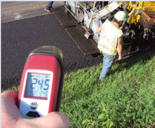
Warm-mix asphalt stays "spreadable" at lower temperatures than hot mix, and this could help municipalities extend their paving season.

Since PennDOT incorporated warm-mix asphalt in Pub 408, Construction Specifications, it has become a viable choice of asphalt production. More than 30 percent of all asphalt placed by PennDOT in 2012 and 2013 was warm mix. PennDOT encourages municipalities to take advantage of the many benefits and consider this new technology when paving local roads. Liquid fuels funds can be used to purchase the product. Stay tuned!