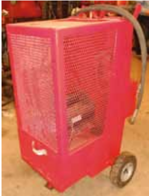
Cranberry Township's portable spreader box pump.

Cranberry Township in Venango County received first-place honors in PennDOT LTAP's 2015 Build a Better Mousetrap Contest, and Rome Township in Bradford County and Manchester Borough in York County placed as runners-up.