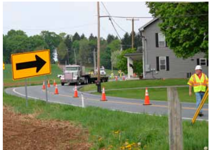
One lane of traffic is shut down on the S-curve where the HFST will be applied.