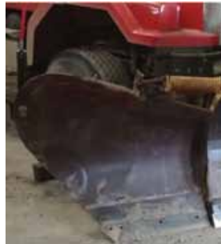
Rome Township's "trip" plow wing.

By cutting a 4-foot piece from an old V-plow, the men created a wing extension for the township's 11-foot snow plow. To minimize the risk of damaging the plow, they designed the wing to trip when it hits something hard. Using the truck mounting brackets from the V-plow and another old plow to create a hinge, they welded it at a slight angle so that when the wing trips, it lifts and swings back. Two trip springs from an unused plow add tension,