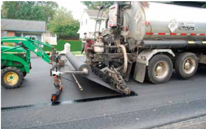
The paving fabric distributor truck sprays PG 64-22 sealant followed by placement of the paving fabric by the spreader/broom tractor unit.

The sealant material must be the same paving grade asphalt as specified in the Superpave overlay. The asphalt distributor must be capable of spraying the asphalt sealant at the prescribed uniform application rate without streaking, skipping, or dripping. The equipment, whether mechanical or manual, used to lay down the fabric must ensure the paving fabric is smooth; a stiff bristle broom or squeegees is used to smooth the paving fabric.