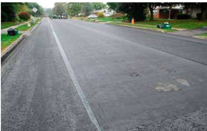
This paving fabric is placed over the Superpave leveling course, which was done the previous day to allow the roadway to cool prior to applying the sealant and paving fabric.

The paving fabric is placed over an acceptable prepared surface. The specified rate of asphalt sealant must be sufficient to satisfy the asphalt retention properties of the paving fabric. With the exception of emergency and construction vehicles, traffic should be kept off the paving fabric.