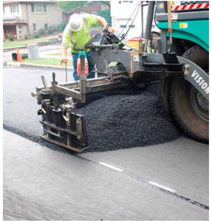
9.5-mm hot-mix asphalt Superpave is placed over the paving fabric.

Finally, placement of the Superpave wearing course should closely follow the laying down of the paving fabric. If any asphalt bleeds through the paving fabric to cause construction problems before the overlay is placed, the affected areas may be blotted with sand. 🚧