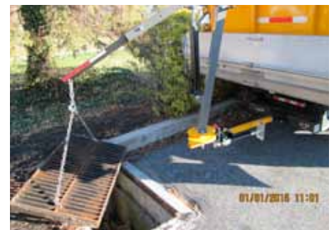
Manchester Borough's MS4 storm drain grate puller.

grates using a backhoe. For about $150, the borough built a tool that makes it easier and quicker to lift grates. The crane can be attached to any truck in the borough's fleet and can also be used for other tasks, such as lifting items into a truck or sign post pulling. 🛠️