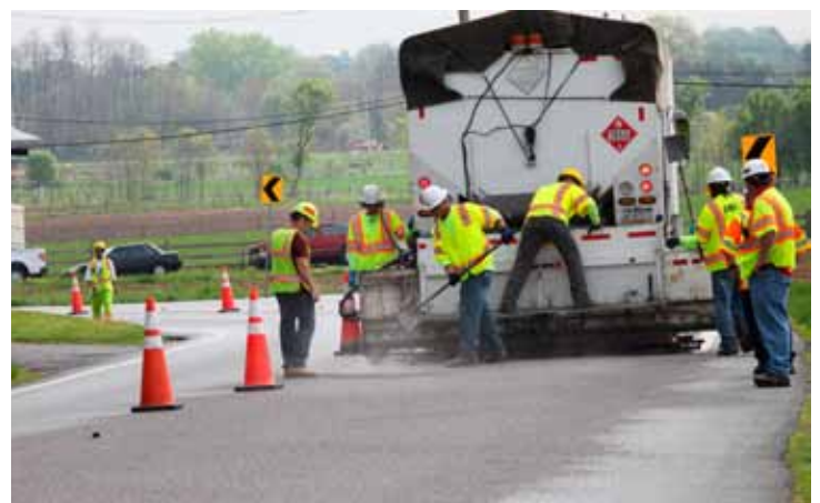
A truck applies the adhesive to the clean and prepared road surface, and a worker uses a shovel to spread the gravel and fill in any spots missed in the gravel application.