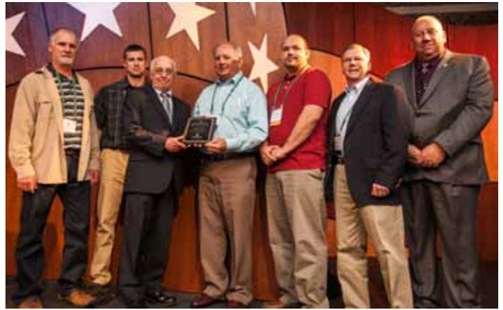
Cranberry Township received its Build a Better Mousetrap award during the 93rd Annual Educational Conference of the Pennsylvania State Association of Township Supervisors (PSATS) held in Hershey in April.

The township wanted to add a wing to one of its plows to be able to push snow back from roadside ditches to allow water to drain efficiently. However, the cost was prohibitive, so the road crew devised a homemade solution.