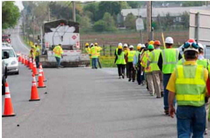
Municipal, state, and federal officials attend a demonstration of HFST application in Lebanon County.

Municipal officials and road crew members joined representatives of PennDOT, the Federal Highway Administration (FHWA), the State Transportation Innovation Council (STIC), and North Cornwall Township, Lebanon County, in May for a regional demonstration day showing the application of an innovative, safety-enhancing pavement surface treatment on a road in North Cornwall Township.