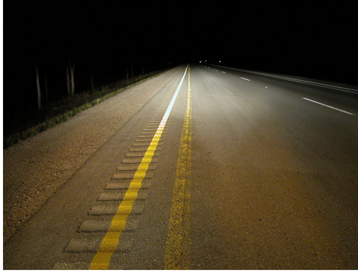
Pavement markings are imbedded with tiny glass beads that provide retroreflective properties and improve visibility for motorists driving under low-light and nighttime conditions.

Pavement markings are imbedded with tiny glass beads that provide retroreflective properties and improve visibility for motorists driving under low-light and nighttime conditions. Over time, the glass beads become worn down and do not reflect the same amount of light as when they were new. When the glass beads are so worn down that they do not reflect a certain minimum amount of light, the inherent safety benefit is lost.