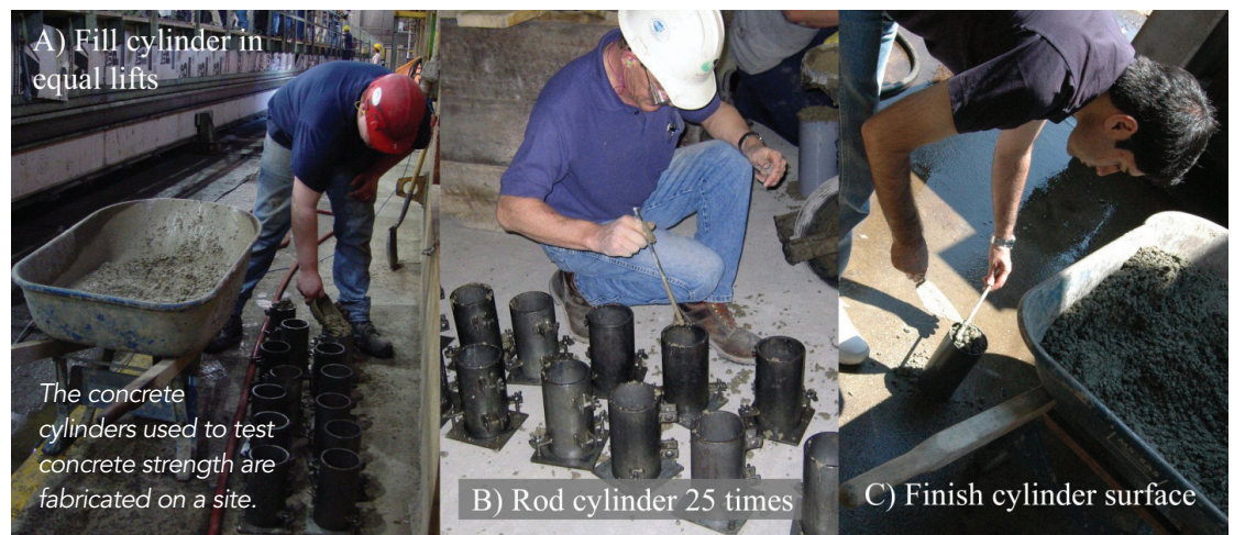
A) Fill cylinder in equal lifts