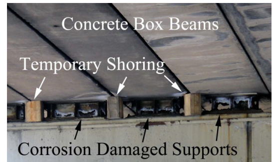
Figure 1: Poorly executed shoring of box beams

Bridge systems are designed to support the weight of pedestrians, traffic, the self-weight of the bridge, and other loads caused by such environmental influences as temperature variations, snow, wind, and earthquakes. These loads can be quite substantial; a typical 50-foot-long, 3-foot-wide precast concrete box beam might weigh on the order of 30,000 pounds. Add on possible traffic loads, and the demands on the beam could increase to more than 50,000 pounds. If the supports for a beam this size are compromised,