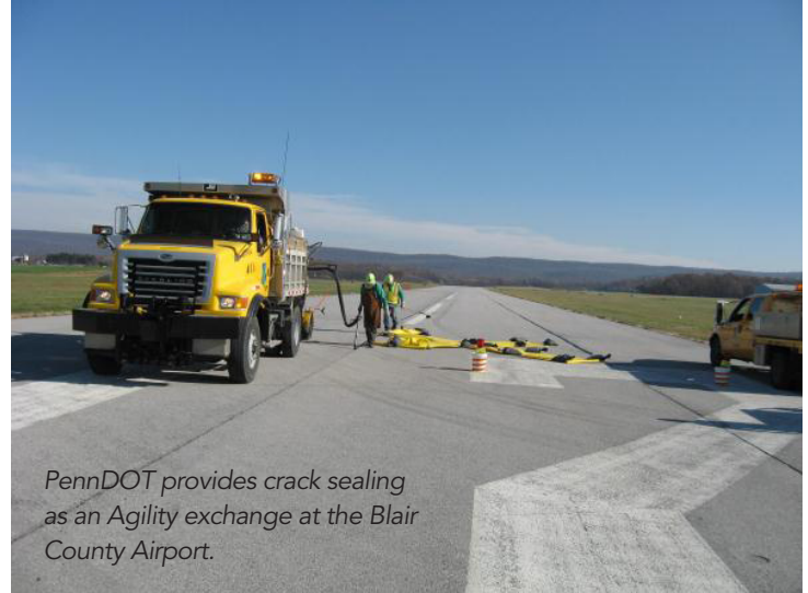
PennDOT provides crack sealing as an Agility exchange at the Blair County Airport.

The Agility Program also allows trading to cross county lines so that a county maintenance office may exchange services with a partner