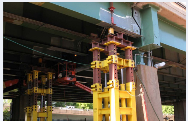
Figure 2: Examples of premanufactured shoring systems