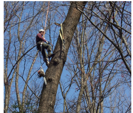
Sometimes, a tree may require an arborist to provide proper pruning.

There are a number of ways you can develop a management plan for the care of your municipality's right-of-way trees. You can do it in-house and manage it as a part of the road crew's work schedule. (You might want to hire a consulting arborist