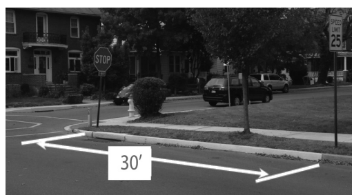
The curb is painted yellow to denote a distance of 30 feet, the statutory distance to restrict parking on the approach to a stop sign.

or improve safety for pedestrians or vehicles. These restrictions require signs. However, curb markings remain optional . If curb markings are used to convey parking regulations in areas where curbs are frequently obscured by snow and ice accumulation, signs must be used with the curb markings for non-statutory parking restrictions.