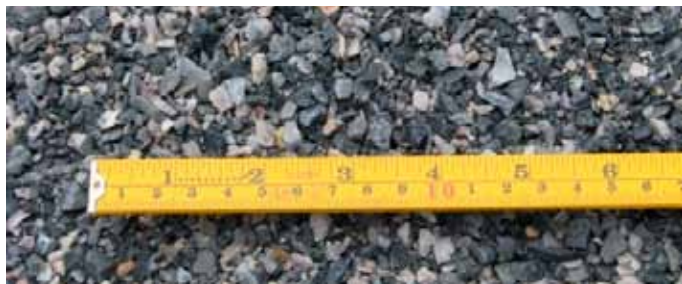
This anti-skid material is approved within Publication 408 as Type AS2. Material provided by York Building Products, Inc. Material production site is located on Roosevelt Aveune in York, Pa.

Each type of anti-skid is further defined within the publication referring to specifics on unit weight, amount of crushed fragments, abrasion loss, and how much metallic iron is allowed within the material. Acceptance of this material requires the producers to provide a Certificate of Compliance (CS-4171) to the municipality for each load.