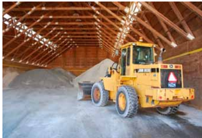
At the Windsor Township, York County, material storage facility, sodium chloride is placed on the right, and Type AS2 anti-skid is located to the left. Material storage like this allows the municipality to spread straight salt or, depending upon the type of winter weather, a mixture of salt and anti-skid.

Aggregates used for traction are found within PennDOT Publication 408, Section 703.4, Anti-Skid Material. If you decide to use cinders, coke, ash, or mine refuse, you will find those specifications within PennDOT Publication 447, Section MS-0450-0001, Anti-Skid Material for Municipal Use. Both products are approved for municipal use although there are differences in availability and use throughout the state.