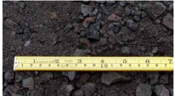
This anti-skid material is approved within Publication 447 as Type 1. Material provided by Ash Resources, Schuylkill Haven, Pa. Material production site is located in Montour County, Washingtonville, Pa.

Each type of anti-skid is further defined within the publication referring to specifics on unit weight, allowable amount of crushed brick, stone, blast furnace slag, steel slag, or gravel, and amount of unburned or partially burned coal or coke.