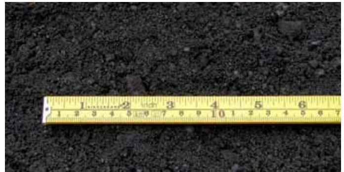
This anti-skid material is approved within Publication 447 as Type 1A. If you compare the photo of Type 1 to Type 1A, you will notice that the Type 1A material is smaller in size, which agrees with the gradation table below. Material provided by Ash Resources, Schuylkill Haven, Pa.. Materail production site is located in Montour County, Washingtonville, Pa.

Acceptance of this anti-skid for municipal use requires the producers to provide a Certificate of Compliance (CS-4171) or (MS-447A) for each load.